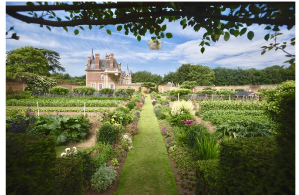
Chateau de Miromesnil

On our way back to Rouen, and time permitting, we will visit Le Chateau de Miromesnil . Dominated by a two-hundred-year-old Lebanese cedar, the grounds of Château de Miromesnil are enclosed by 17th-century brick walls sheltering fruit trees, rose bushes, magnolias and tree peonies.