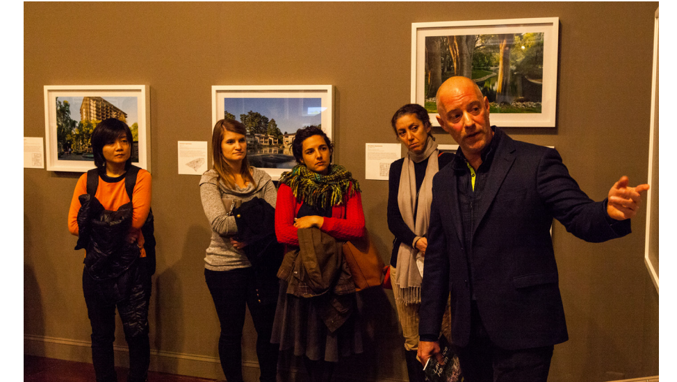
[above] National Building Museum’s “Spotlight on Design” series, Washington, D.C.