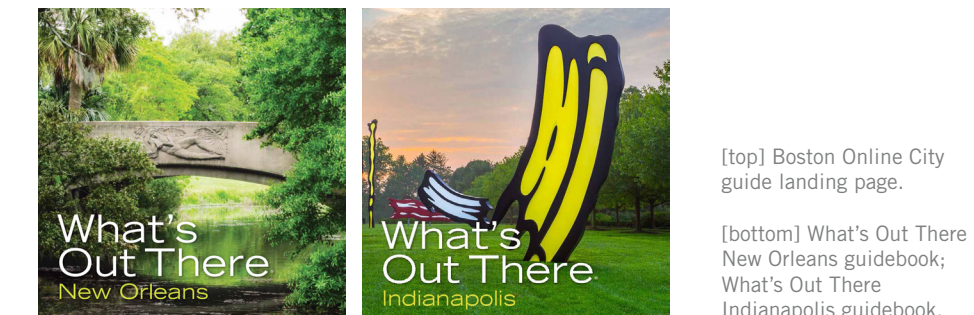
[top] Boston Online City guide landing page.