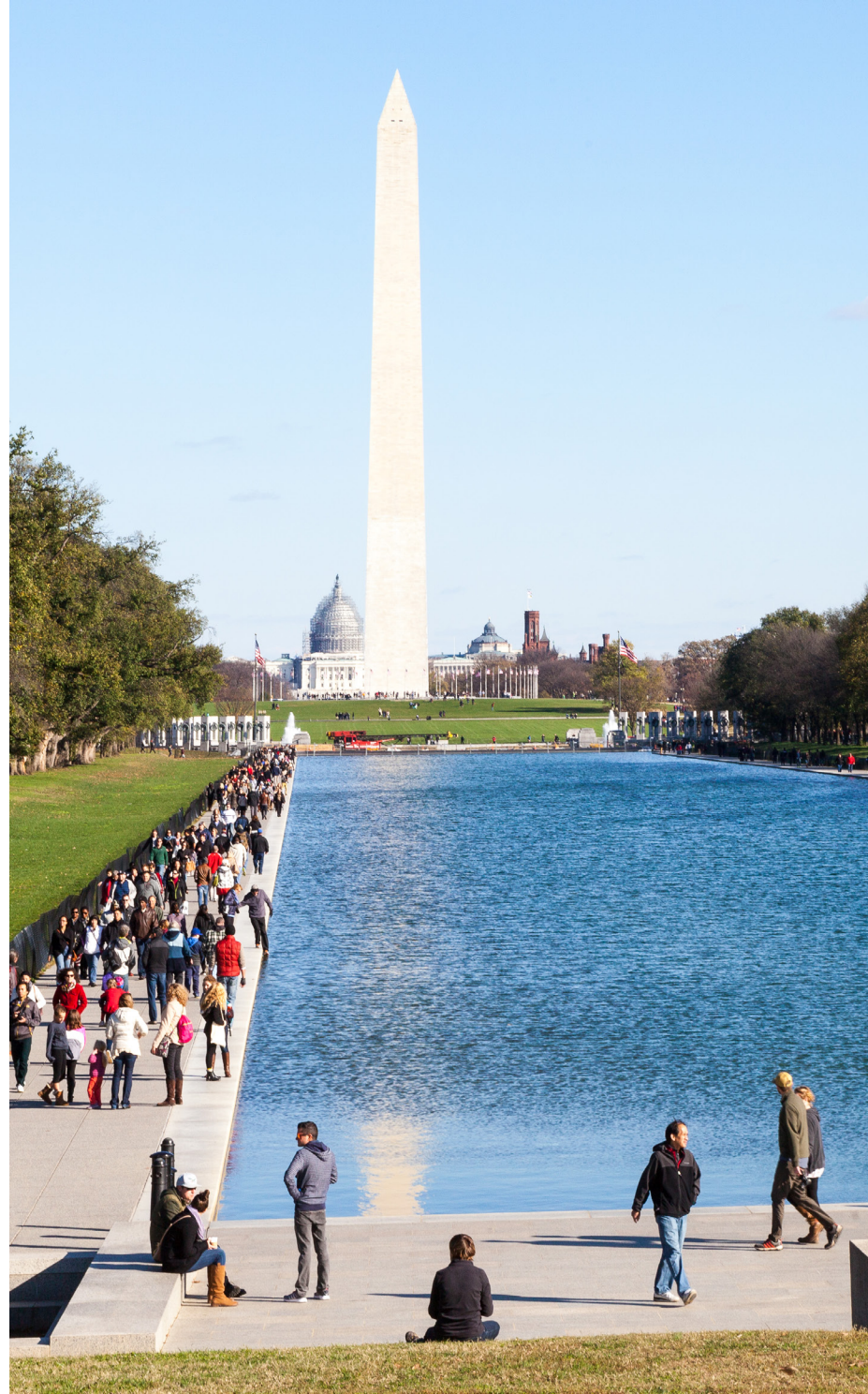
Lincoln Memorial Grounds, Washington, D.C.