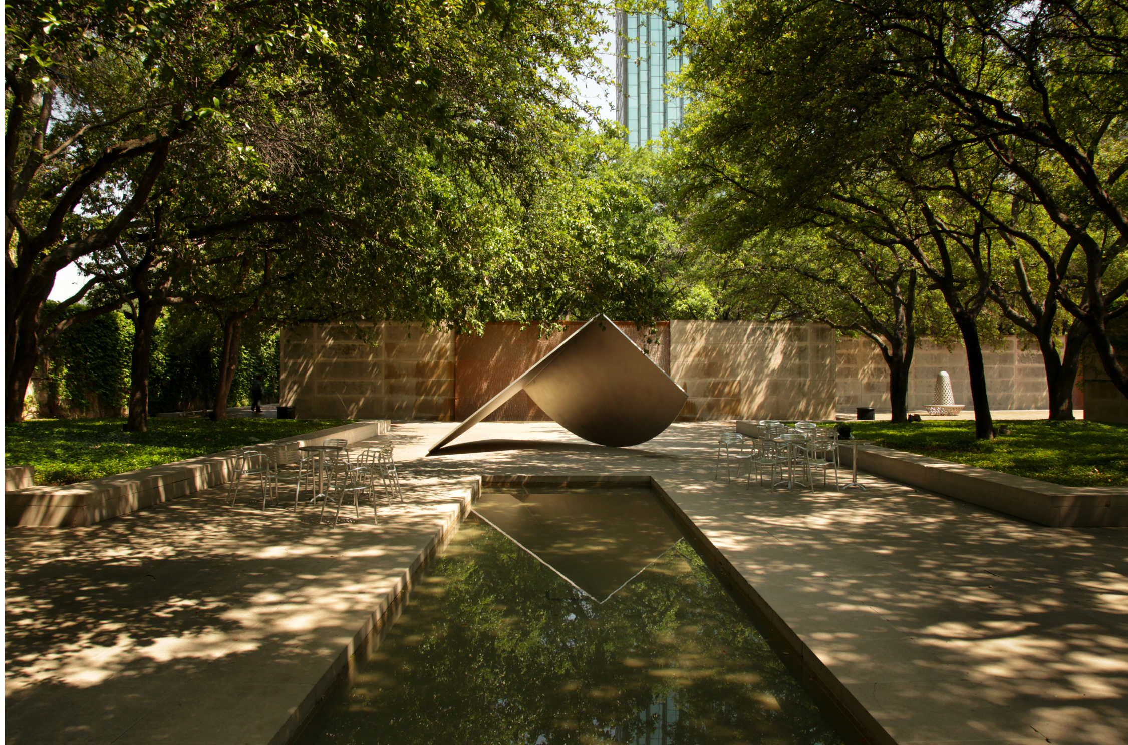
[left] Dallas Museum of Art, Dallas, T.X.