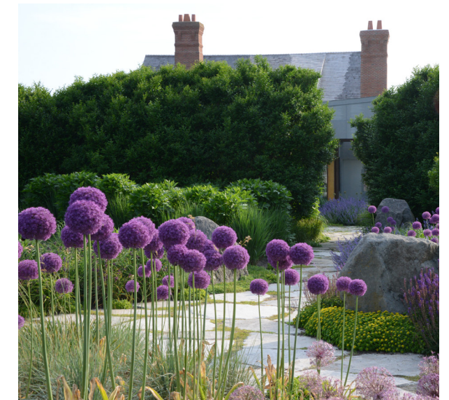
The New American Garden at the Slifka Beach House, Sagaponack, N.Y.

This traveling photographic exhibition covers the lives and careers of Wolfgang Oehme and James van Sweden, who created the "New American Garden" design style, which is based on the American meadow. The exhibition debuted on October 17, 2015, at the National Building Museum in Washington, D.C. and was supplemented with drawings, plans, furniture, and other artifacts designed by Oehme and van Sweden, along with artwork from private collections and the National Gallery of Art. In 2017 the exhibition was on display at the Cylburn Arboretum, January 14 – March 26, then went on to The Nassau County Museum, August 3 – September 10, and finally the Elmaleh Gallery, Campbell Hall, School of Architecture at UVA, October 2 – December 1.