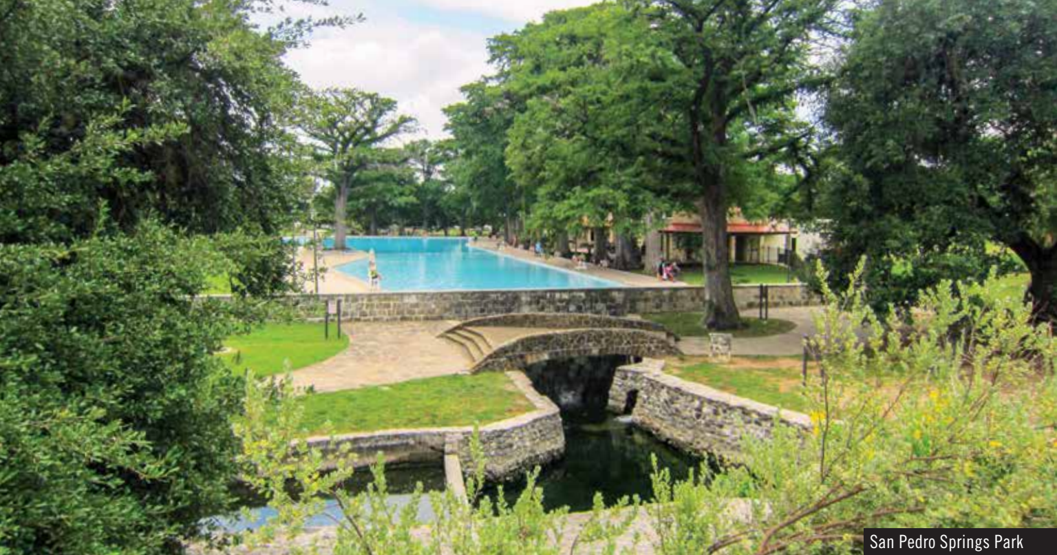
San Pedro Springs Park