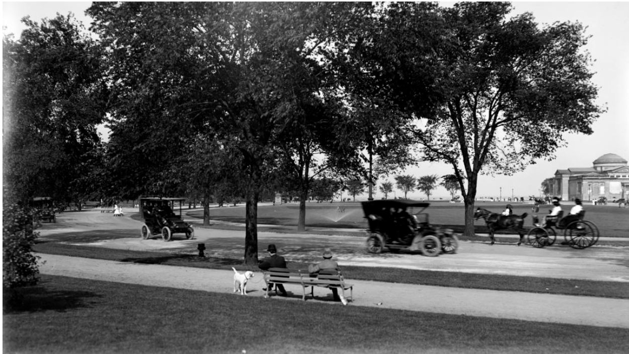
Fig.4: Horse-drawn carriages and motorcars share the curvilinear roads of Jackson Park, early 1900s

disposition of the roads were accidental, their curvilinear form intended to contrast with the right-angled streets of the urban grid. In a preliminary report on the nearby designed community of Riverside, Olmsted wrote, in 1868, “as the ordinary directness of line in town-streets, with its resultant regularity of plan, would suggest eagerness to press forward, without looking to the right hand or the left, we should recommend the general adoption, in the design of your roads, of gracefully-curved lines, generous spaces, and the absence of sharp corners, the idea being to suggest and imply leisure, contemplativeness and happy tranquility.” 18 As with Olmsted and Vaux’s Riverside, the curvilinear flow of the roads in Jackson Park was conceived as a key element in organizing access to the planned scenic narrative.