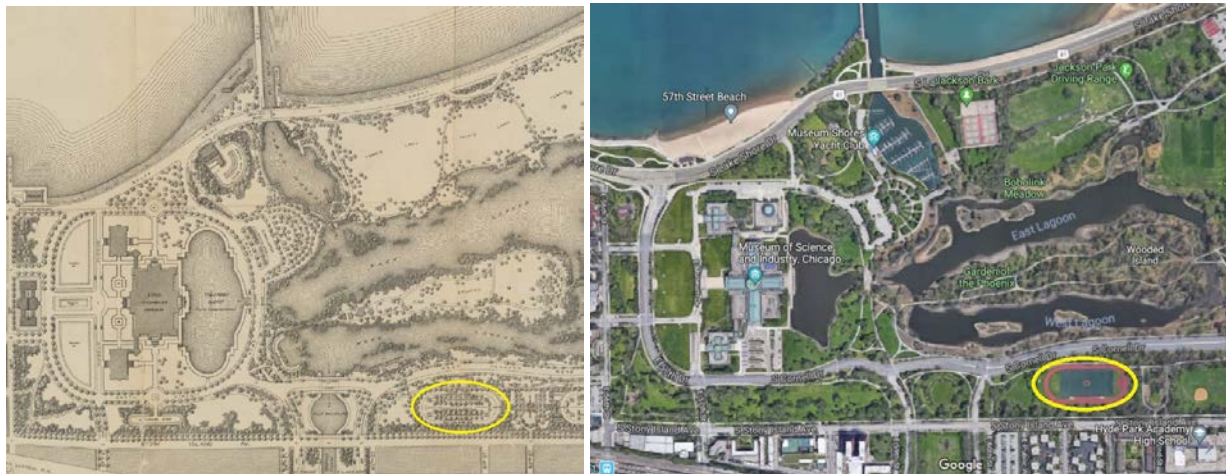
Fig. 3: North gymnasium, 1895 Revised General Plan for Jackson Park (l.); present football field in Jackson park (r.)

In addition to the masterful use of the lakeshore, open fields, and interior waterways, Olmsted designed two large, open-air gymnasia along the park’s western perimeter just south of its junction with the Midway Plaisance. The two oval gymnasia, one for men and the other for women, were separated by a children’s playground (fig. 2), and both were encircled by running tracks that were also used by bicyclists. With the initial groundwork completed at the beginning of 1896, 9 the outdoor gymnasia in Jackson Park were a reform-era response to the condition of the city’s working-class neighborhoods and were relatively new in the United States. 10 Olmsted specifically touted these elements of the overall design, reporting that “similar gymnasia proved very successful in Europe and in Boston.” 11 The outline of the north gymnasium is still expressed in the footprint of the oval football field along the park’s western perimeter (fig. 3), which serves in a recreational capacity while echoing the form of the Olmsted-designed gymnasium.