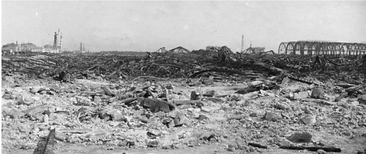
Fig. 1: Photograph of Jackson Park taken after a series of fires at the site in 1894

standing in the end. In 1895, Olmsted, Olmsted & Eliot presented a sweeping redesign of Jackson Park that retained “many of the features characteristic of the landscape design of the World’s Fair” while providing “all of the recreative facilities which the modern park should include for refined and enlightened recreation and exercise” (fig. 2). 4