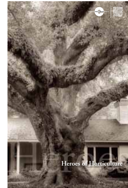
Heroes of Horticulture Exhibition Gallery Guide

Also this year, TCLF laid the groundwork for transitioning tclf.org to web 2.0 which will allow for greater interaction and a more user friendly infrastructure. The new website, which will be launched in fall 2009, will include portals that allow users to “enter” the site and view information according to their age/knowledge level.