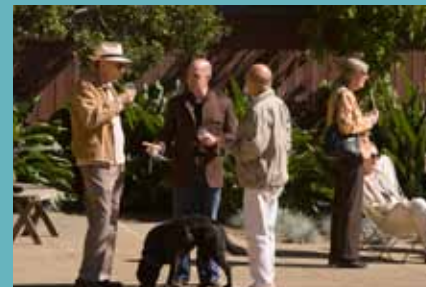
Donnel Garden Gala, Sonoma, CA