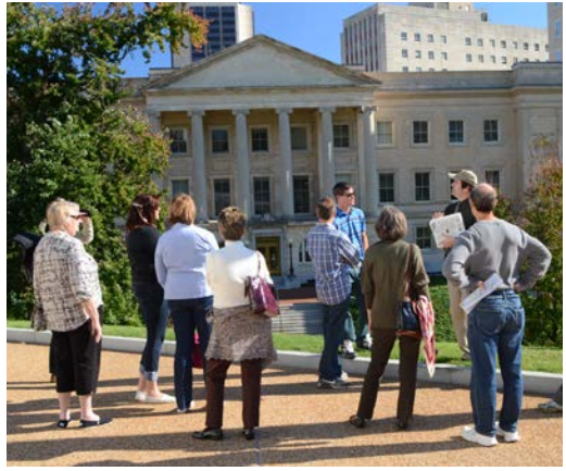
What's Out There Weekend Richmond, Capitol Square designed by Thomas Jefferson and John Notman