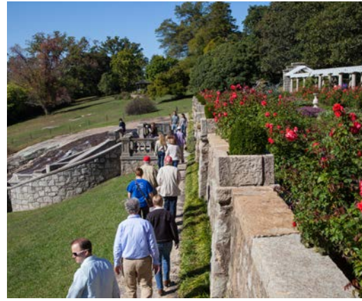
What's Out There Weekend Richmond, Maymont

In excess of 1,000 participants enjoyed fall colors and tours of nearly 30 landscapes, many documented by students at the University of Virginia. Modernist landscapes, such as the former Reynolds Metals Company International Headquarters, Rice House, and Kanawha Plaza, were complemented by Colonial Revival estates, including the Kent-Valentine House, Tuckahoe Plantation, and Virginia House. Tours of Hollywood Cemetery, Capitol Square, and the Virginia War Memorial raised the visibility of local history, while the tour of the Tredegar/American Civil War Museum focused on the significant role that Richmond has played in U.S. history. The Weekend was supported in part by Bartlett Tree Experts, the Charles Luck Stone Center, the University of Virginia's School of Architecture, the Lewis Ginter Botanical Garden, Nelson Byrd Woltz, The Valentine, Victor Stanley, and the Virginia Chapter of the ASLA.