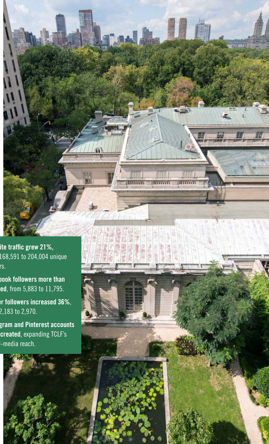
Frick Collection Garden by Russell Page in New York City