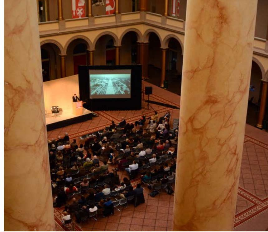
National Building Museum Spotlight on Design: Reed Hilderbrand and the Legacy of Dan Kiley