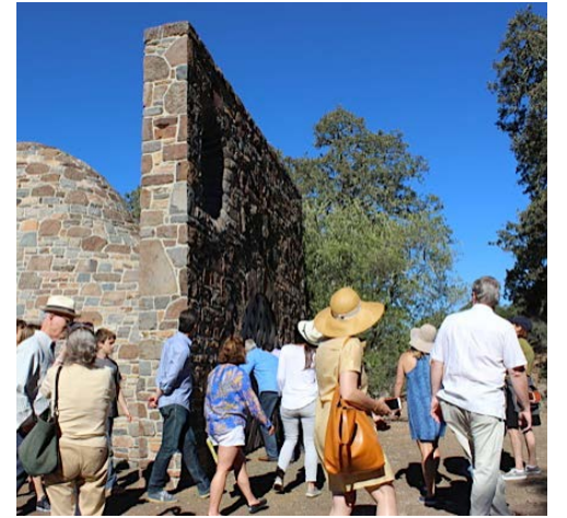
A tour of Oliver Ranch in Sonoma County, California