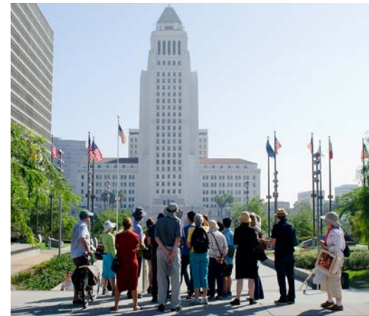
What's Out There Weekend Los Angeles: Public Landscapes of Ralph Cornell, Grand Park by Cornell, Bridgers and Troller and Rios Clementi Hale Studios