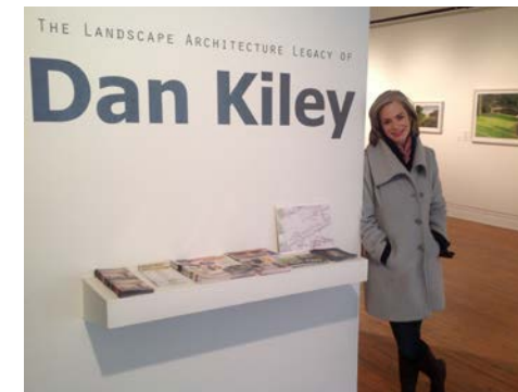
Landslide 2013: The Landscape Architecture Legacy of Dan Kiley traveled to four cities in 2014