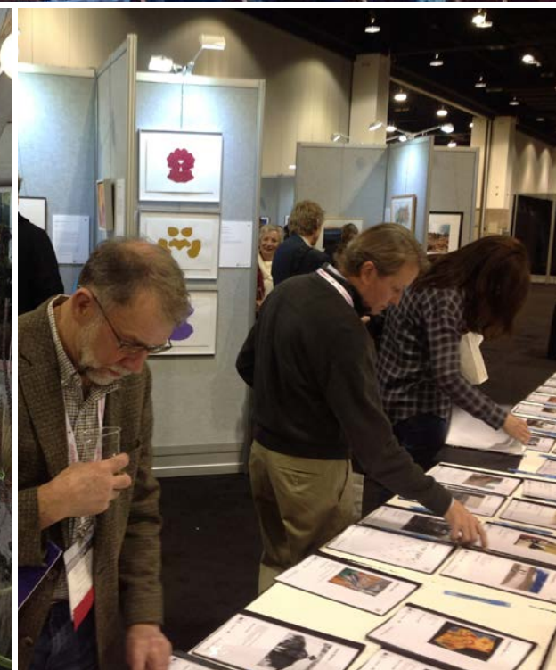
[Opposite, top photo] Guests enjoying TCLF's Rocky Mountain Mod Excursion at the U.S. Air Force Academy Cadet Chapel, Colorado Springs, designed by Walter Netsch, Jr.; [Lower right] ASLA EXPO attendees participating in TCLF's 10th annual Silent Auction; [Lower center] TCLF presented its 2014 Stewardship Awards and launched the What's Out There Denver Guide at the Denver Botanic Gardens, which featured an outdoor exhibition by Dale Chihuly; [Lower left] TCLF Excursion guests approaching the U.S. Air Force Academy Chapel, crossing the landscape designed by Dan Kiley