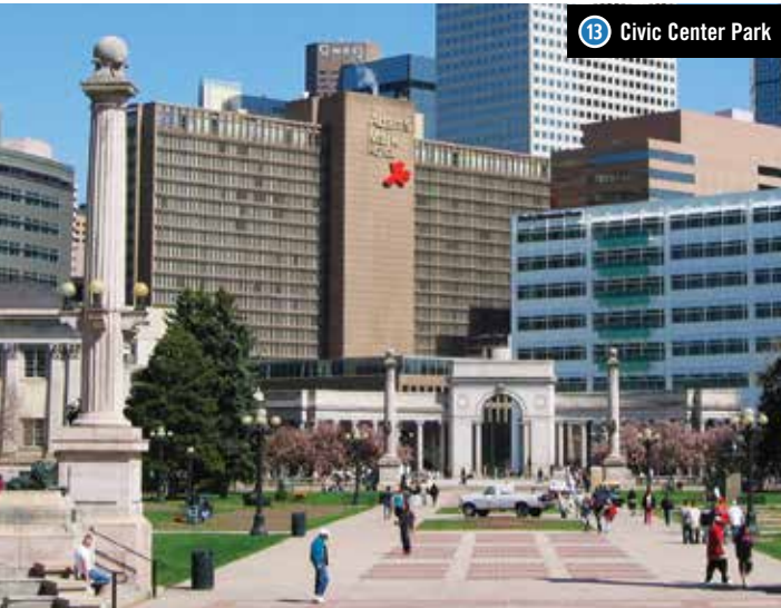
13 Civic Center Park