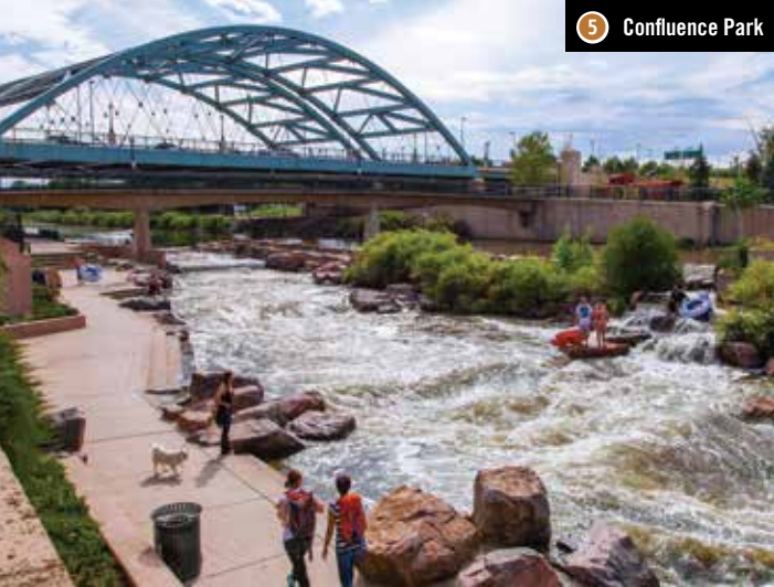
5 Confluence Park