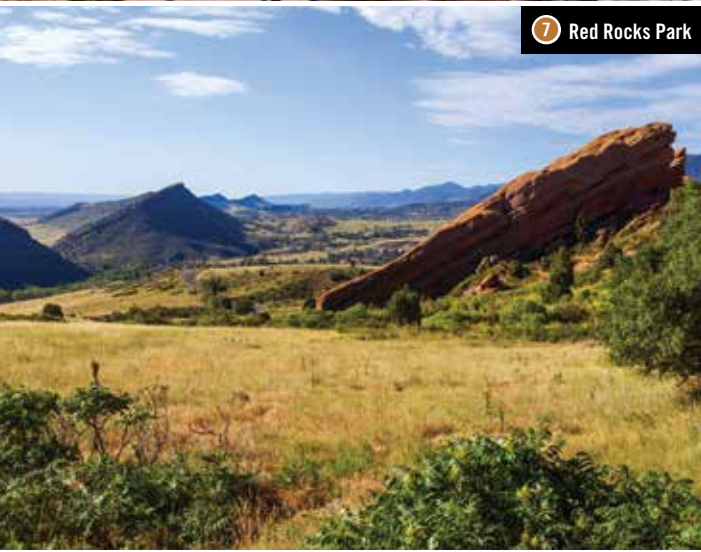
7 Red Rocks Park