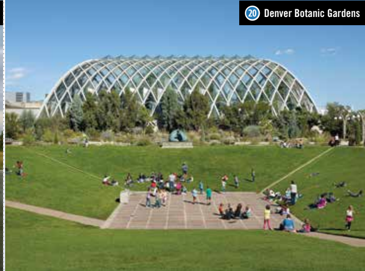
20 Denver Botanic Gardens