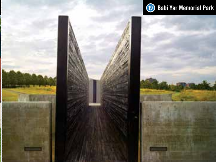
19 Babi Yar Memorial Park