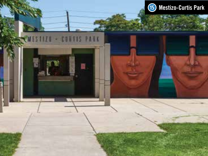
15 Mestizo-Curtis Park